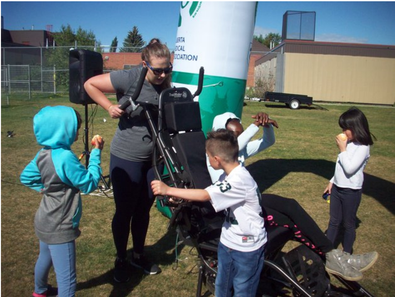
Bees to honey ... PSA's Trail Rider was very popular